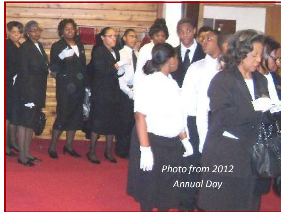
Photo from 2012 Annual Day

"Behold, how good and how pleasant it is for brethren to dwell together in unity!" - Psalm 133:1 (NKJV)