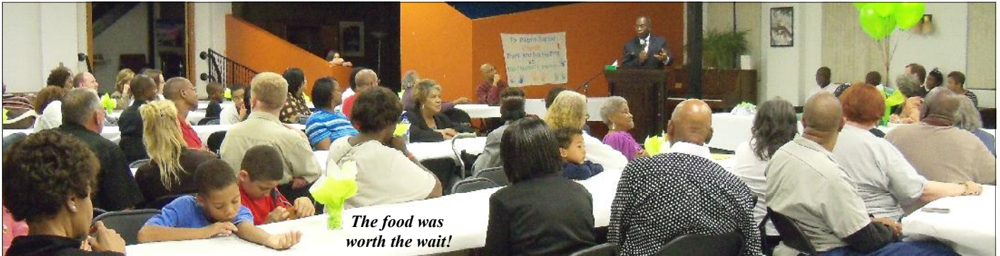
The food was worth the wait!