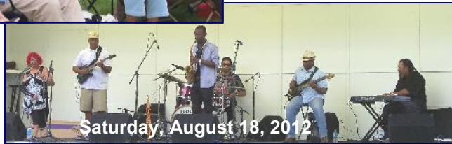
Saturday, August 18, 2012