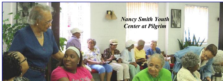
Nancy Smith Youth Center at Pilgrim