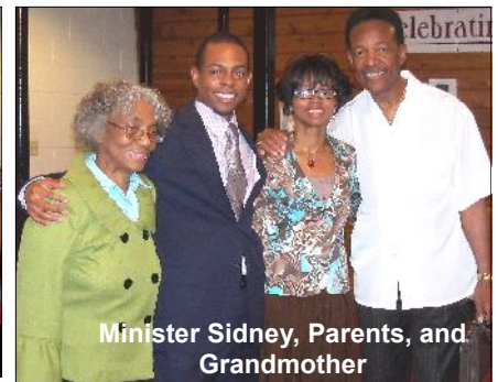
Minister Sidney, Parents, and Grandmother