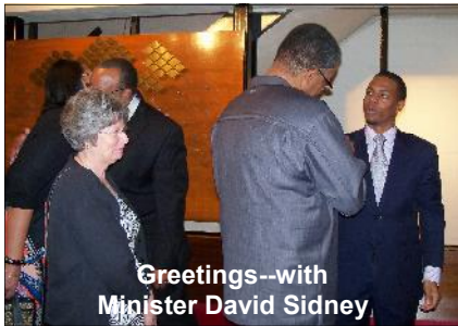
Greetings--with Minister David Sidney