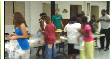
One of F.Y.R.E.’s sleepover activities was to assemble bags of back-to-school supplies for students at Pilgrim’s “adopted” school, Lathrop Elementary.