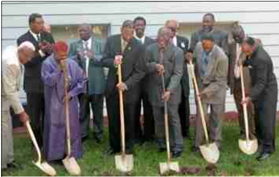
Deacons and Trustees take a turn with the golden shovels.