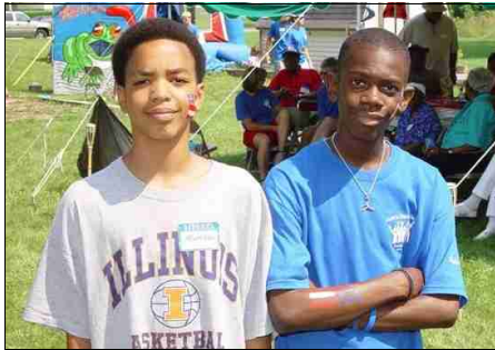
Pilgrim Youth at the "Big Event"