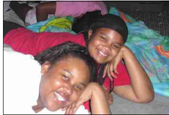
"Sleep-Over" Fun at Pilgrim