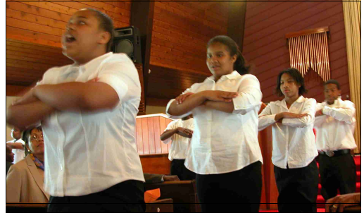
The "Pilgrim Steppers" — new in 2006