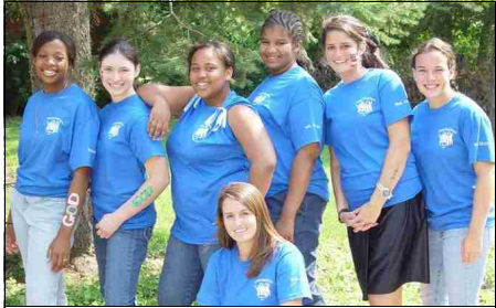
Pilgrim and Tabernacle Youth

KUDOS! . . . to our youth who display excellence in all they do. The following photos were previously published in "The Pilgrim Messenger" and show some of the youths' activities during 2006.