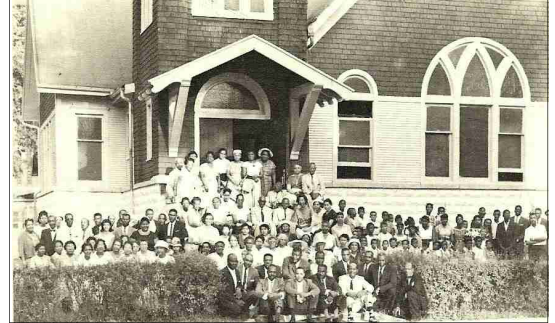
Pilgrim Baptist Church members shown in front of the building on West & Morgan Streets in 1960

Pilgrim marched to the present home at 1703 South Central Avenue in March, 1961 from the building still located on the corner of Morgan and West Streets. (A brief history of Pilgrim was published in a Special Anniversary issue of “The Pilgrim Messenger” , copies of which are available at the church.)