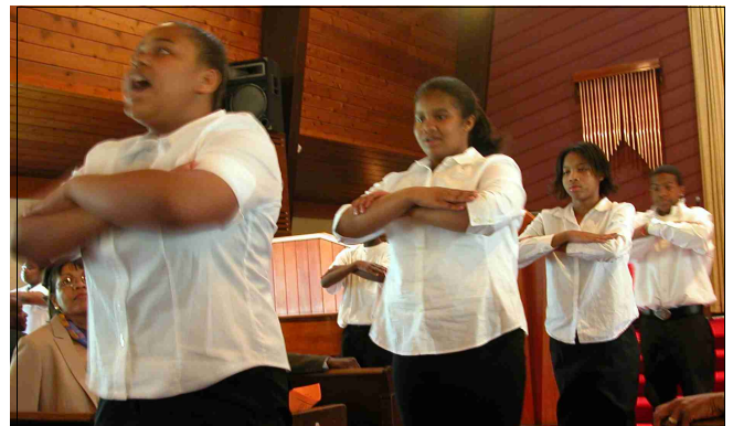
“The Pilgrim Steppers”